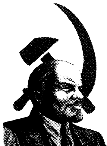
Well known friend of democracy.

Recently, to a chorus of gloating on the left, Jean-Marie Le Pen himself was fined and given a suspended sentence because he got into a pushing match with opponents during the legislative elections last year. The court has stripped him of his right to hold office, but Mr. Le Pen has appealed the decision. He will continue as regional councilor and member of the European Parliament until a ruling is made on the appeal—perhaps in two