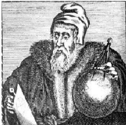
Figure 2. John Dee

The Tables that form what are commonly referred to as the Watchtowers were received by Dee and Kelly, during the Spirit Actions, from the period of Tuesday, April 10, 1584 through April 18, 1587. During this period their formation evolved and changed and produced a number of arrangements that often confuse the practitioner of the Enochian system. The Golden Dawn and such other modern systems as the Aurum Solis and A.'.A.'. use only the final evolution of this structure and then impose upon it an hierarchy of governance that is only loosely based on the derivations of rulership given to Dee and Kelly by the Angles during the Spirit Actions. We shall first explain this evolution with some possible explanations for existence. Then we shall explore the hierarchies as given by the Angels, in the various visions of the Watchtowers (such as the well known one immortalized in the Golden Talisman), in the methodology for nomenclature formulation given by the Angels in the Spirit Actions and finally in Dee's own development in his Enochian grimoire, Liber Scientiæ Auxilii et Victoriæ Terrestris . 1