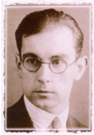
Enters the University of Zurich, 1926